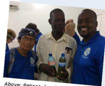
Above: Patient showing off his 50 Fl Oz hydrocele after his vasectomy.