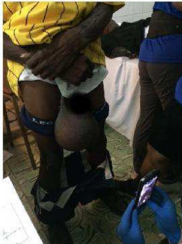
Above: Huge hydrocele rarely or perhaps never seen in the US.